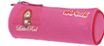
PENCIL CASE ROUND - 122WNG602