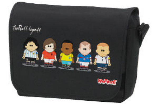
COURIER BAG - 122WNB722