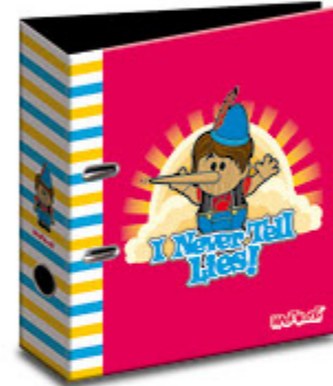
LEVERARCH FILE - 122WNG240