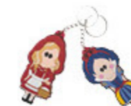
KEYCHAINS - 122WNG551