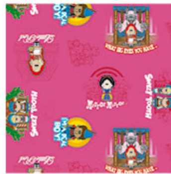
WRAPPING PAPER - 122WNG281