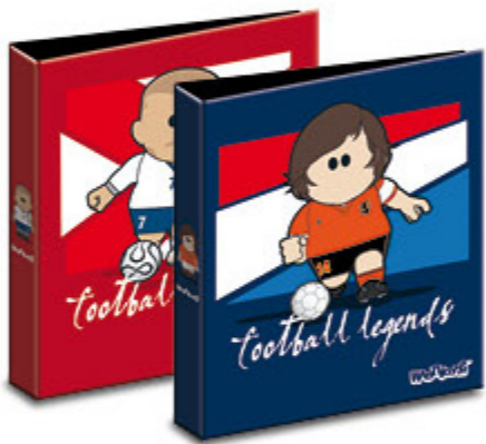
RINGBINDER A4 - 122WNB220-223