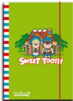
ELASTICATED FILE - 122WNG242