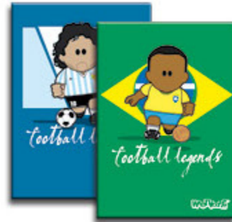
EXERCISE BOOK A4 - 122WNB210