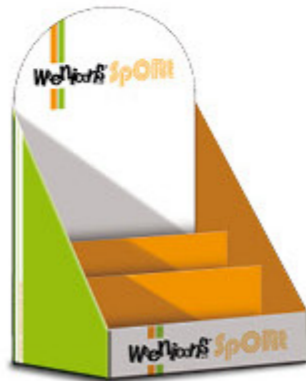
DISPLAY - 122WNB490