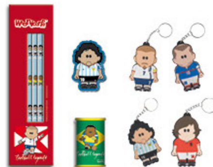
PENCILS, ERASER, SHARPENER, KEYCHAINS