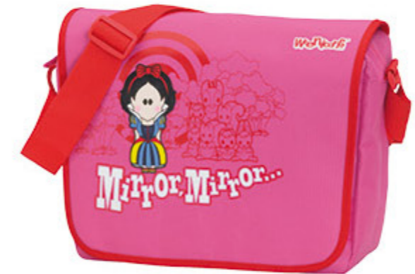
COURIER BAG - 122WNG722