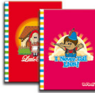
EXERCISE BOOK A4 - 122WNG210