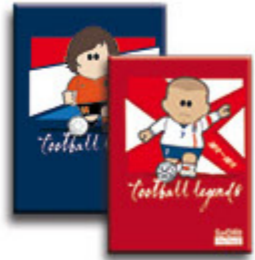
AGENDA INT. - 122WNB120