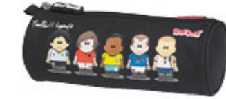
PENCIL CASE ROUND - 122WNB602