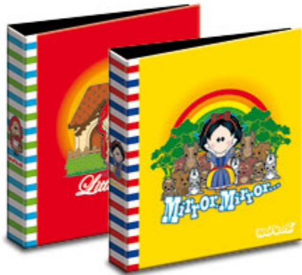
RINGBINDER A4 - 122WNG220-223