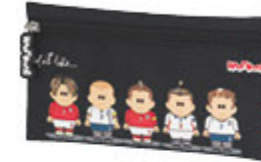
PENCIL CASE FLAT - 122WNB600