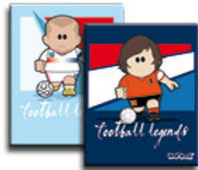
EXERCISE BOOK A5 - 122WNB200