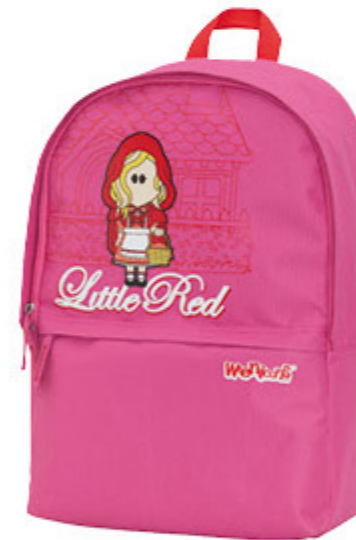
BACKPACK D-PACK - 122WNG702