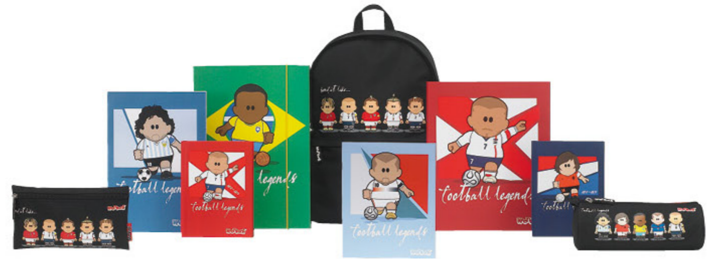
SOCCER HEROES BROUGHT TO LIFE IN STRONG DESIGNS COMBINED WITH FRESH COLOURS