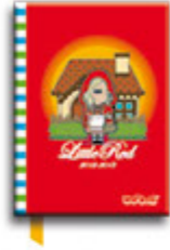
AGENDA INT. - 122WNG120