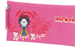
PENCIL CASE FLAT - 122WNG600