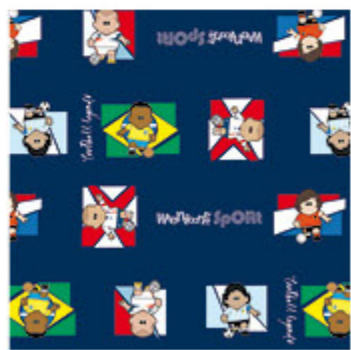
WRAPPING PAPER - 122WNB281