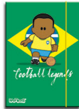
ELASTICATED FILE - 122WNB242