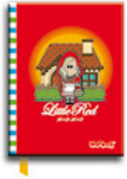
AGENDA - 122WNG100