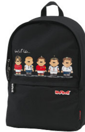
BACKPACK D-PACK - 122WNB702