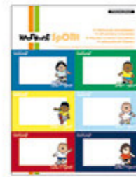
SCHOOL LABELS - 122WNB280