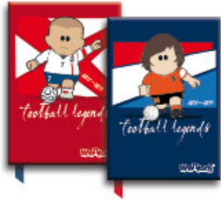
AGENDA - 122WNB100