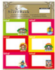
SCHOLLABELS - 122WNG280