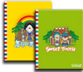
EXERCISE BOOK A5 - 122WNG200