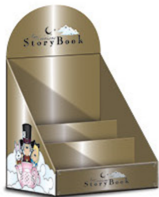
DISPLAY - 122WNG490