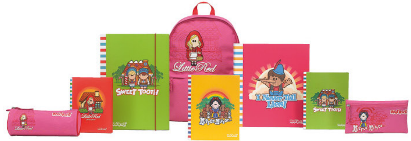
STORYBOOK FIGURES COMBINED WITH CATCHY TEXTS AND POPPY COLOURS