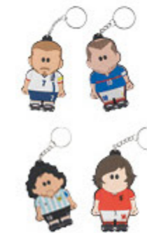
KEYCHAINS - 122WNB551